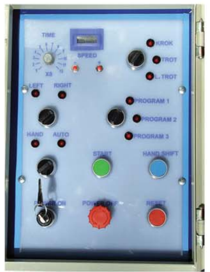
Wood Shaving Machine