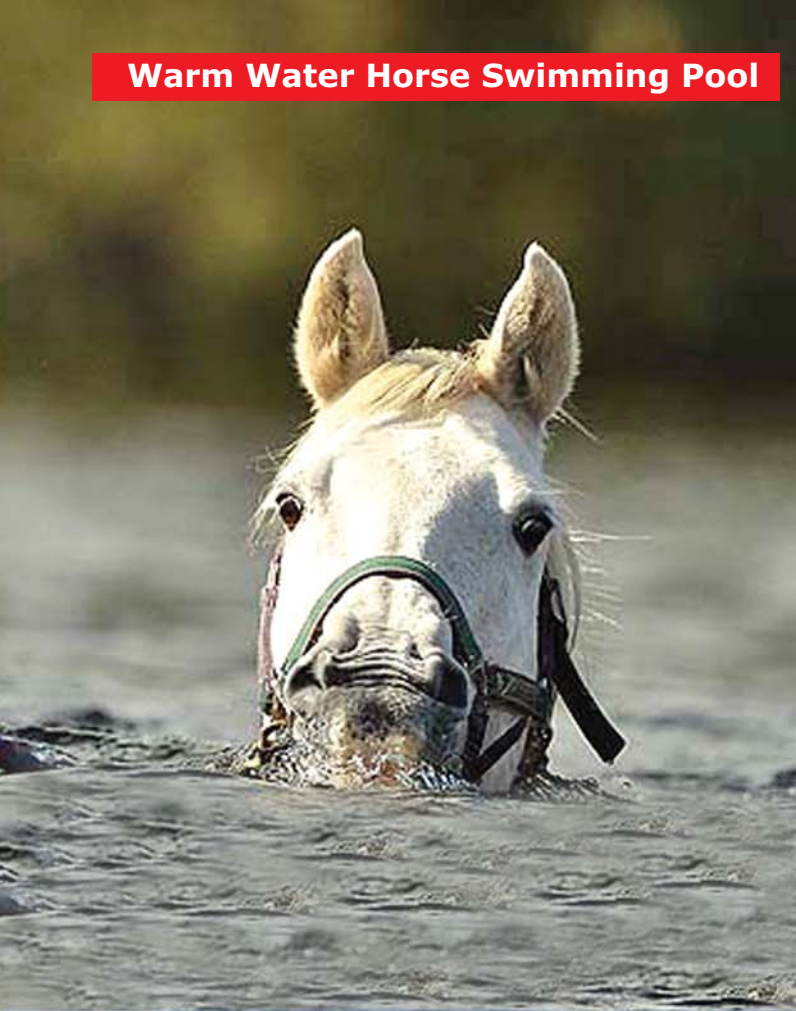
Warm Water Horse Swimming Pool