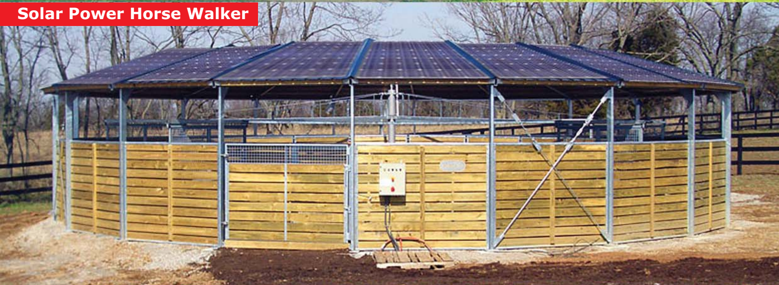
Solar Power Horse Walker