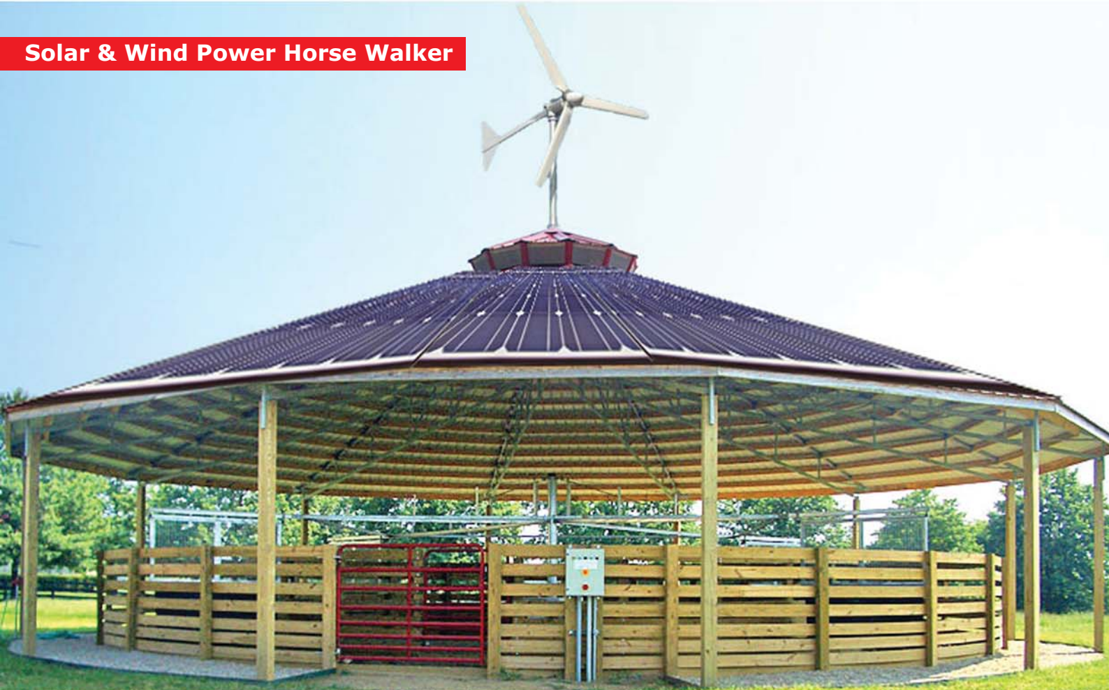
Solar Power Horse Walker